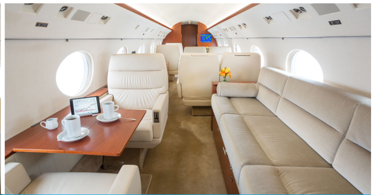
TRAVELING IN LUXURY Shlomo Rechnitz' jet includes a full kitchen, reclining chairs, a conference table, and two divans.